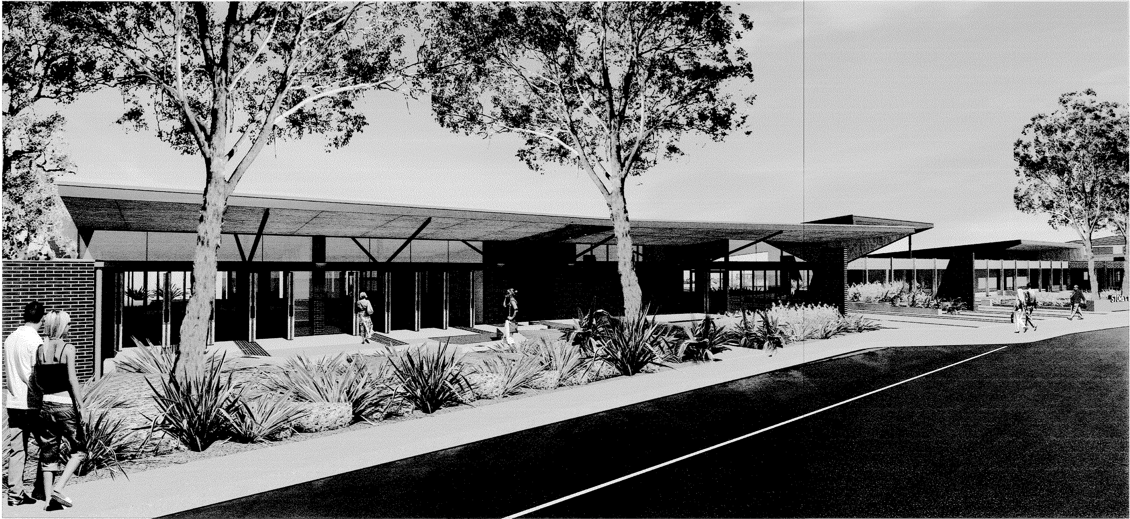
03 COMMUNITY ROOMS FACING STREET