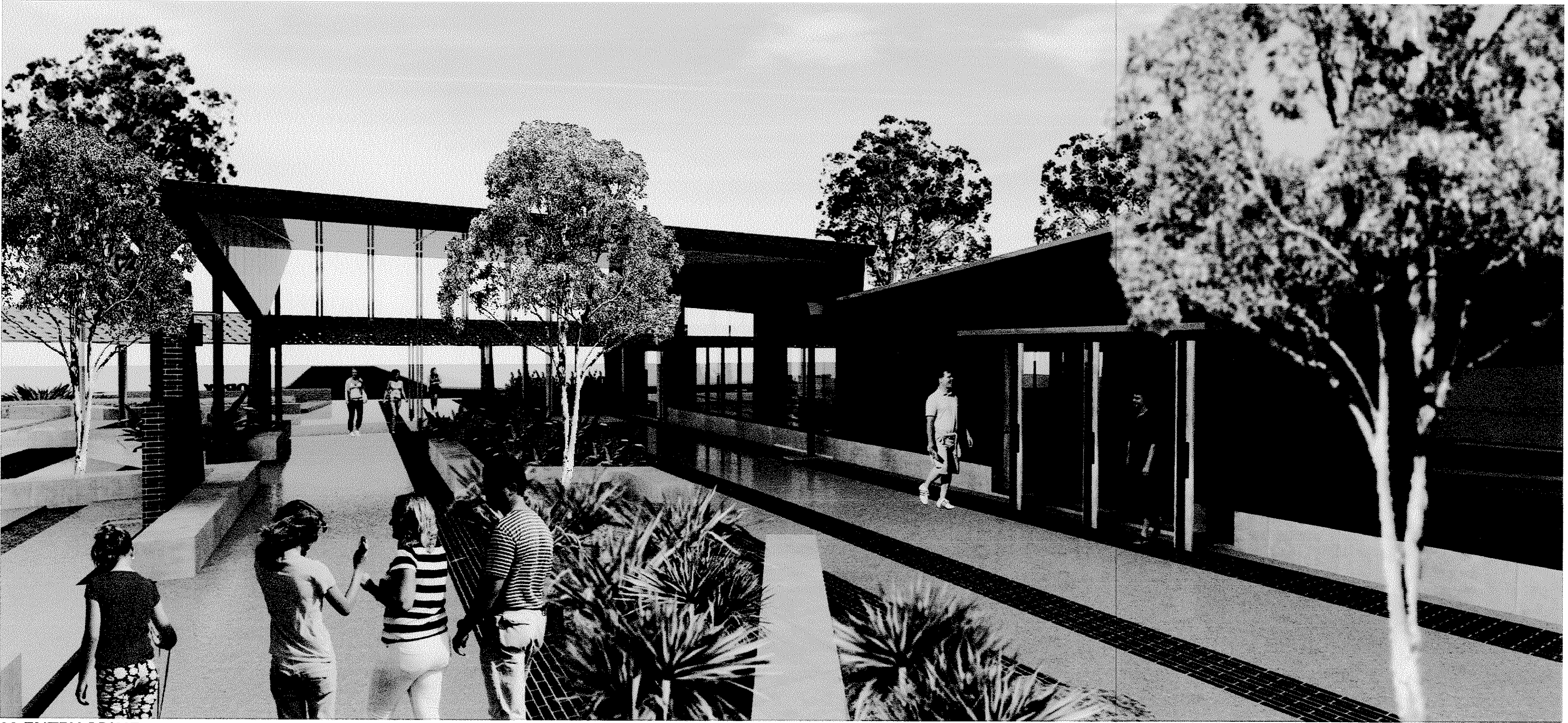
06 ENTRY SPINE