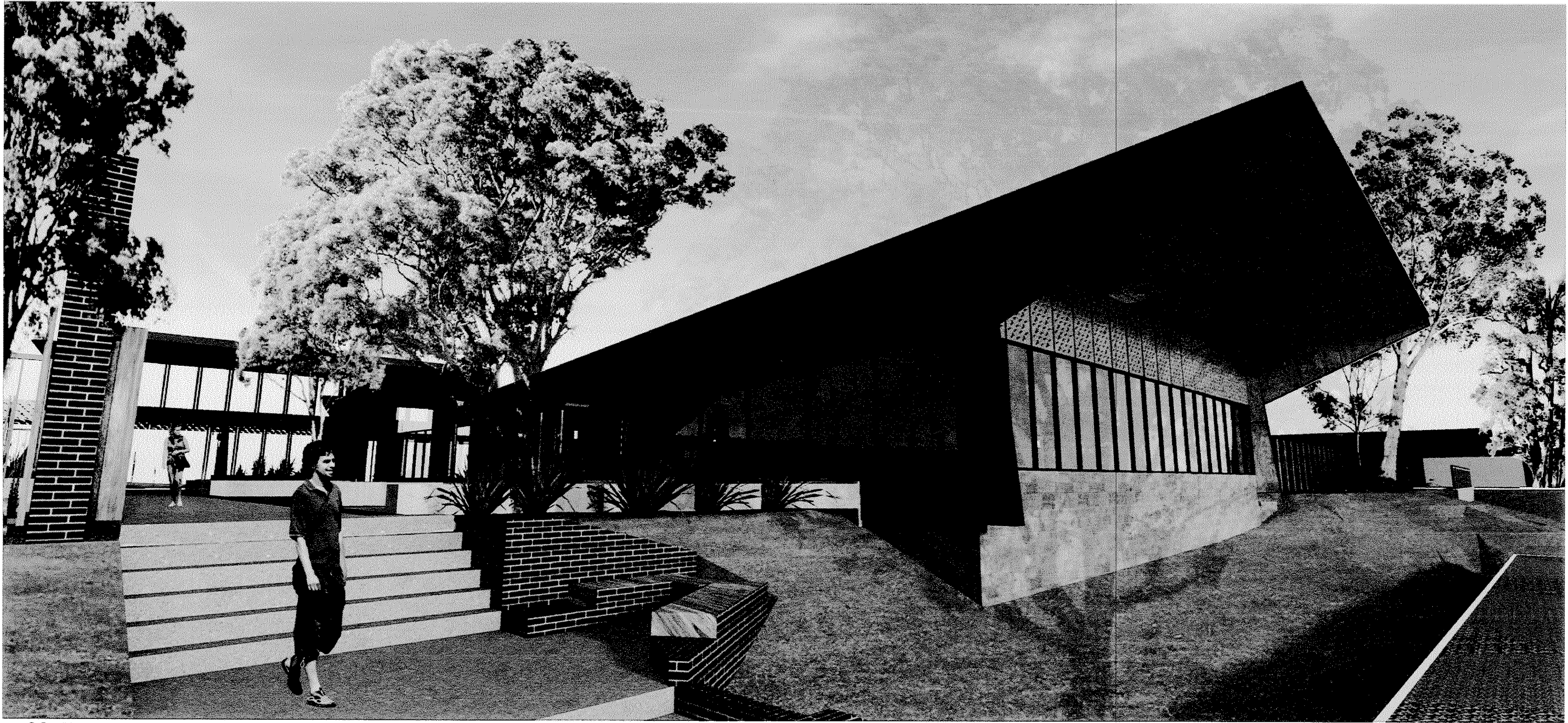
05 COMMUNITY HALL