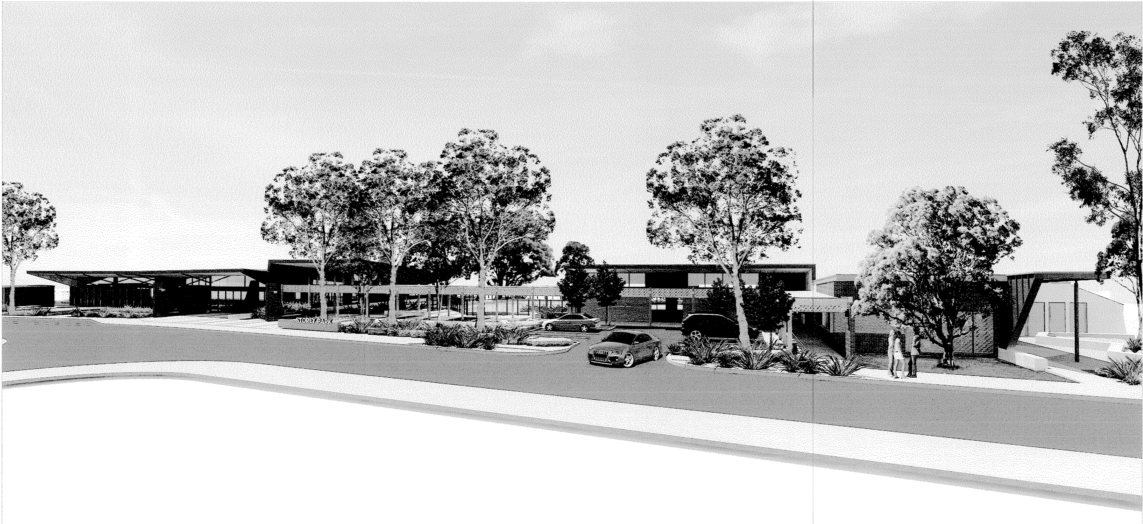
04 COMMUNITY AND CHILDCARE BUILDINGS